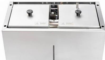
Laboratory water distiller A 1104 (Liston, LLC)