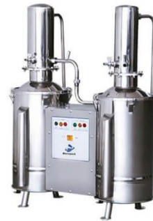
Stainless steel Re-distilled Water Distiller, WDST-D Series