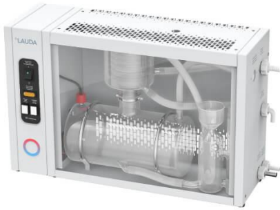
LAUDA Puridest stills Puridest PD 12 R