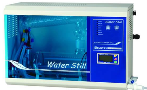
WS400 4L/hr Automatic Water Distiller