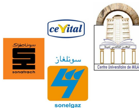
Figure 2. some employers