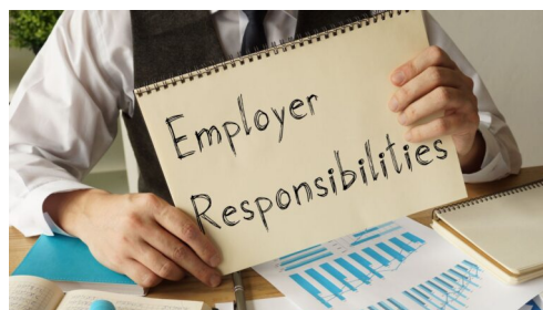
Figure 3. Employer responsibilities

As an employer, you must assess all the risks to which your employees may be exposed and implement preventive and protective measures, including ensuring that each worker has received the appropriate health and safety information and training.