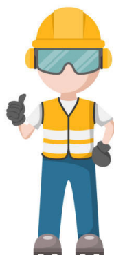
Figure 5. Health and Safety Officer