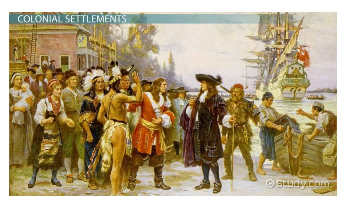
Depiction of the first encounters between European settlers and Native Americans