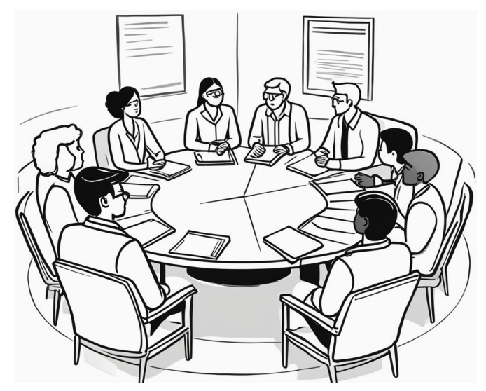
Figure 4. Health and safety meeting of Health and Safety Committee