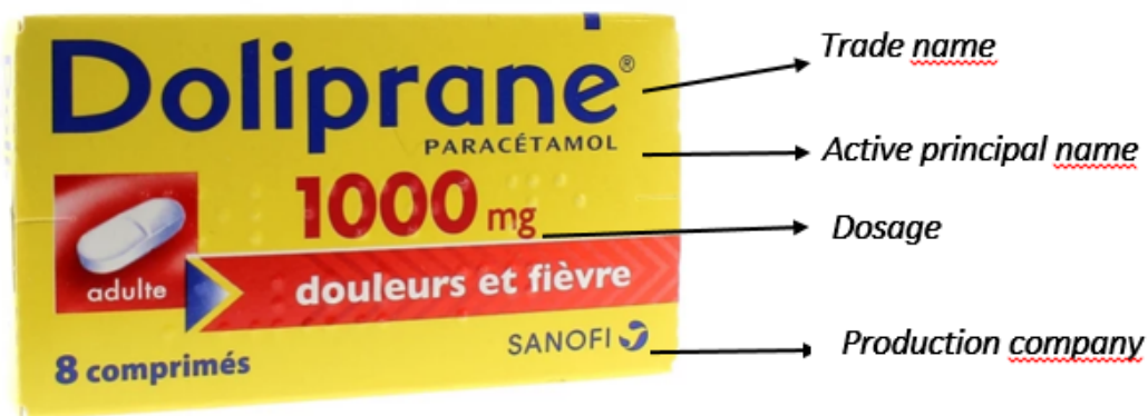
Fig. 2 Essential information about a medicine.